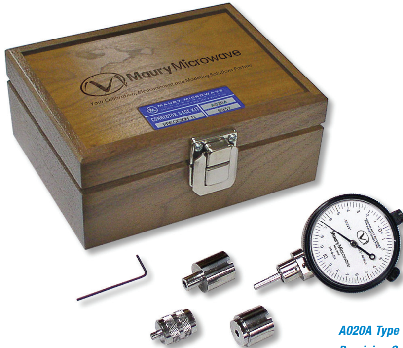
A020A Type N Precision Connector Gage Kit