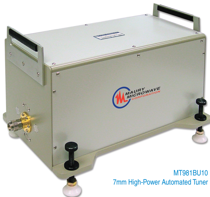
MT981BU10 7mm High-Power Automated Tuner