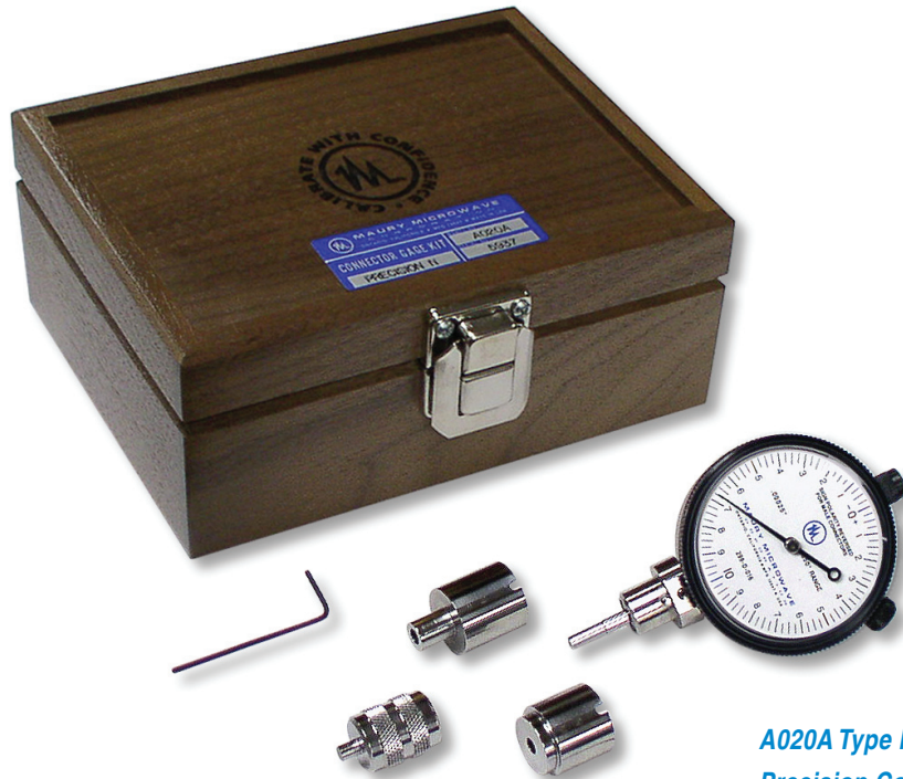
A020A Type N Precision Connector Gage Kit