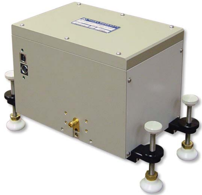
MT984AU01 2.4mm 50 GHz Automated Tuner