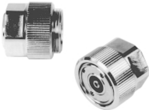
Front View of the 2680S